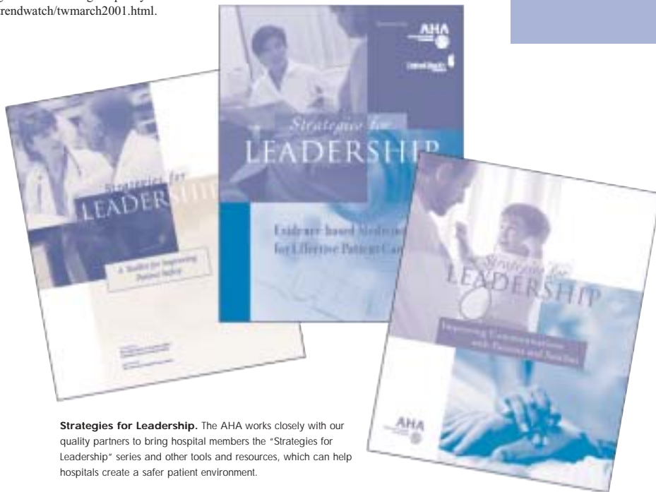
Strategies for Leadership. The AHA works closely with our quality partners to bring hospital members the "Strategies for Leadership" series and other tools and resources, which can help hospitals create a safer patient environment.