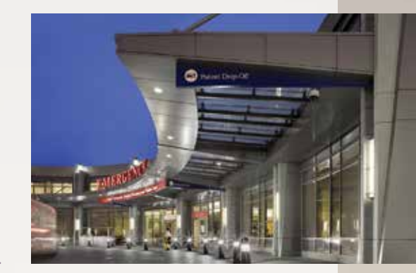
FINALIST Duke University Hospital | Durham, N.C.