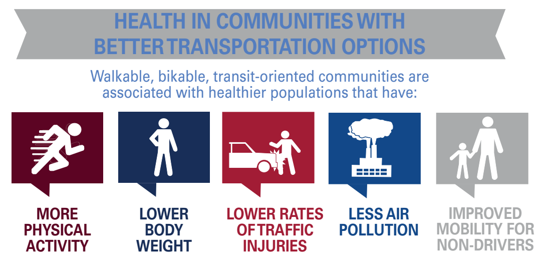
Figure 2. Better Transportation Options Can Lead To Healthier Lives