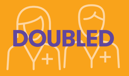
Doubled the capacity of our electronic ICU system—providing all patients access to an ICU team regardless of hospital location