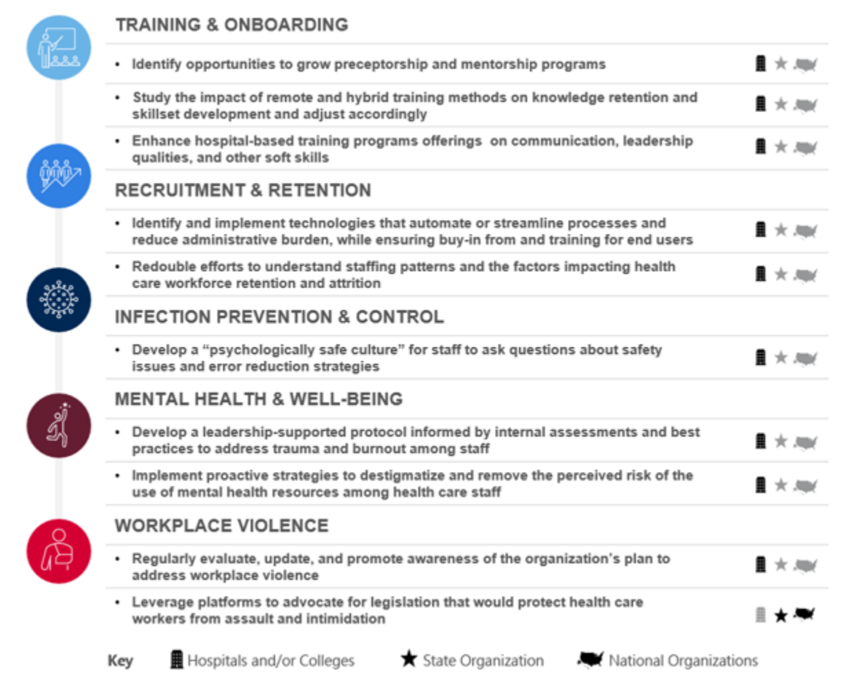
Figure 1: Summary of Recommendations