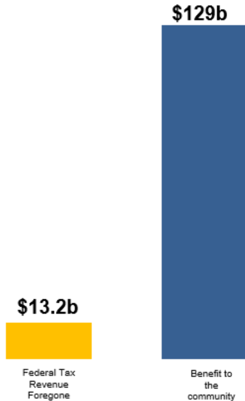
Figure 1. Federal tax revenue forgone compared to US nonprofit hospital community benefits provided by hospitals, 2020

SOURCE: Ernst & Young LLP calculations. Community Benefit from 'Results from 2020 Tax-Exempt Hospitals' Schedule H Community Benefit Reporting' American Hospital Association, October 2023