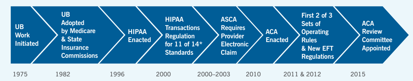
Figure 3: Administrative Simplification Timeline

The process of advancing administrative simplification and standardization has been underway for more than 40 years.